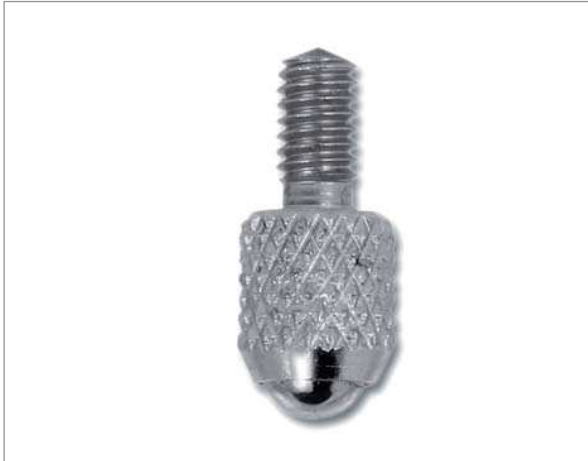
Tastspitzen / Mechanical front Zeichnung / Drawing