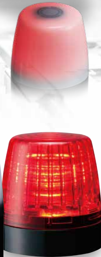
Mono-color Model (Red)